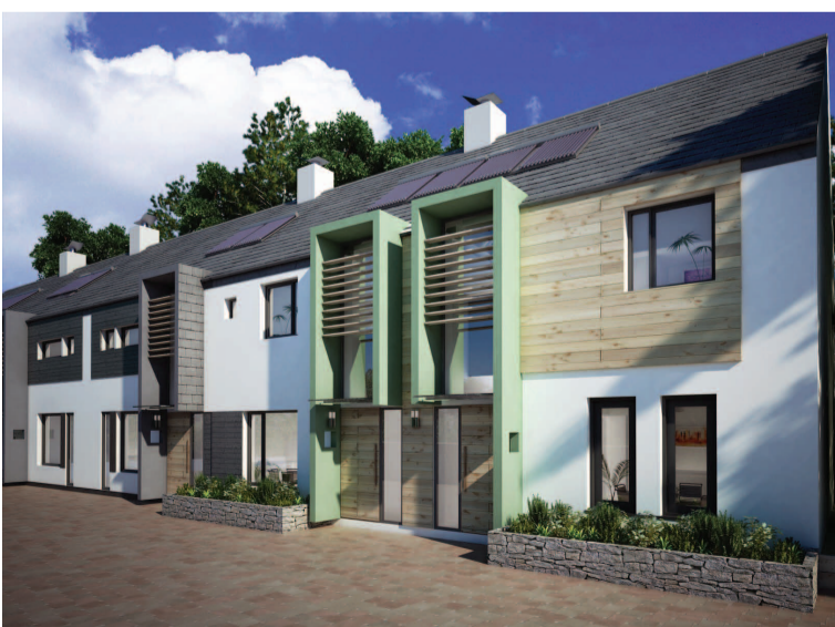
Cornwall's Eco Town in St Austell / winning Architects

0.2 Trewin Design joins the team for Cornwall's Eco Town in St Austell / Devon Architects, Trewin Design Partnership has been selected to join the