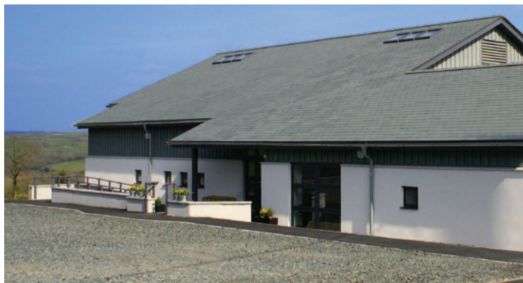
Ashwater Village Hall / Multi Purpose Community Hall